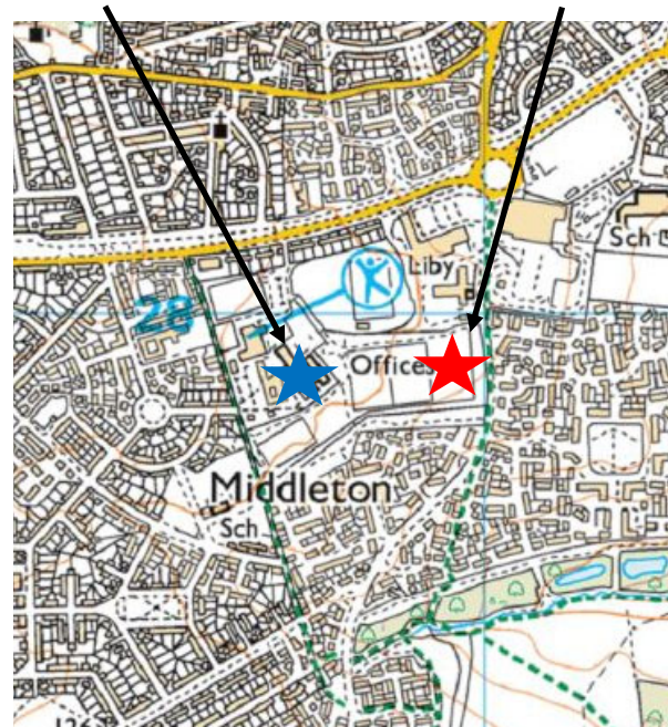
Phase 1 temporary site

View our proposals online at: https://www.cockburnlca.org/news/